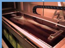
Fr 14-jun-'02 PM