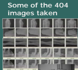
Some of the 404 images taken